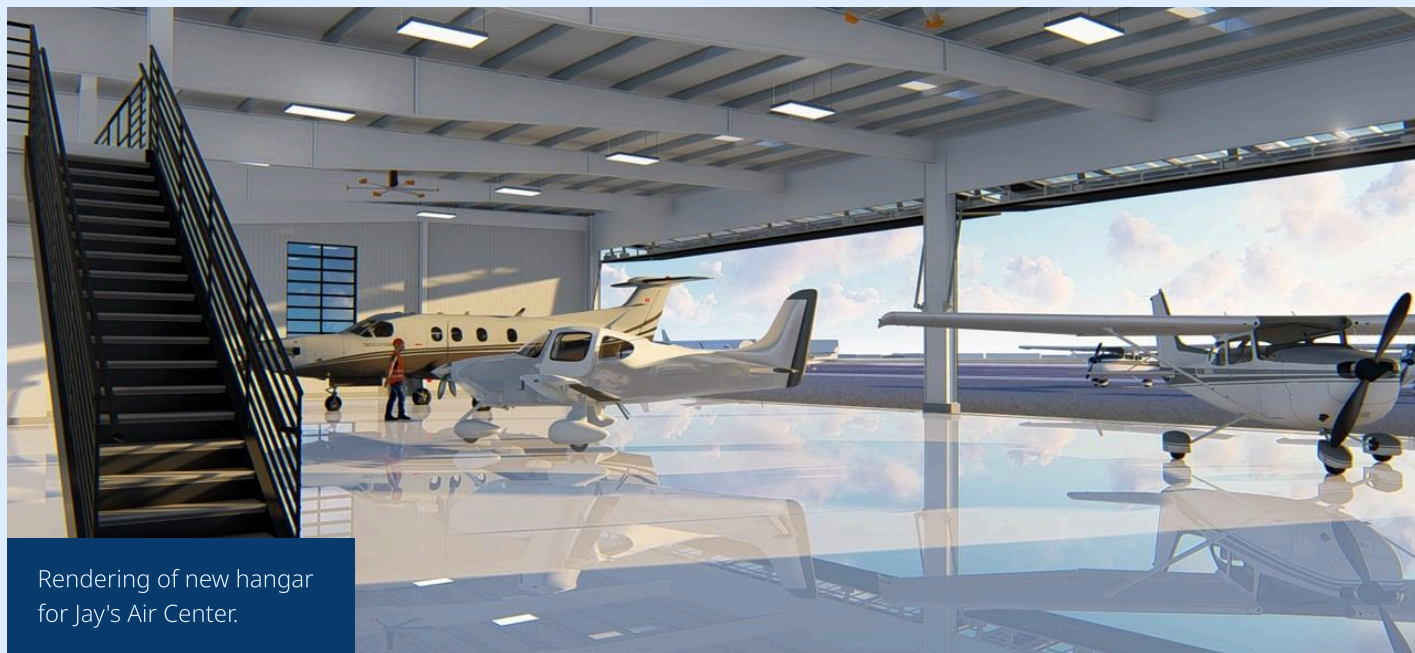
Rendering of new hangar for Jay's Air Center.

We'll finalize the plan review of Jay's 14+ acre limited-service Fixed Base Operator (FBO) development project and initiate construction in the fall of 2026 as part of our General Aviation Improvement Program (GAIP). This development will help us accommodate larger aircraft, improve office space for private aviation users, and provide enhanced safety improvements for general aviation operations.